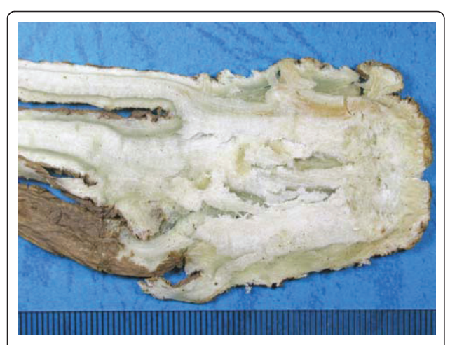
Figure 1 A section of root of Angelica sinensis (Oliv.) Diels (Apiaceae) used in Chinese medicine.